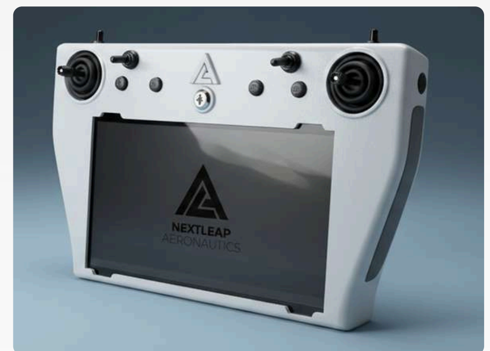
XCONTROL Remote Controller