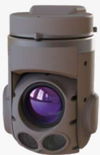
ControParas Micro 300