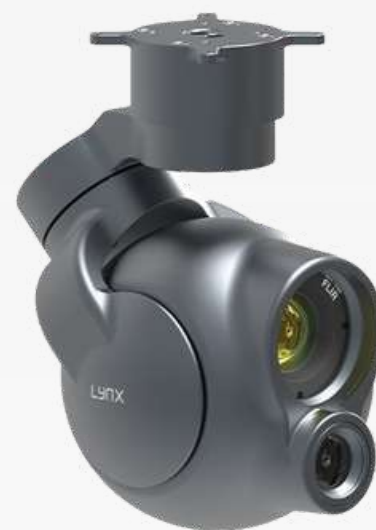
Gremsy Lynx NDA compliant